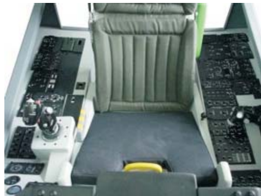
Detailed view from the inside

(Pictures show the Viper I with optional accessories)