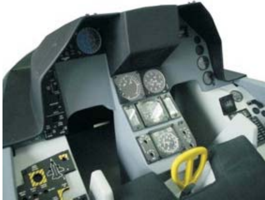
Center panel view