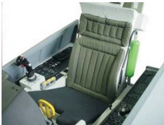
The ACES II ejection seat

(Pictures show the Viper I with optional accessories)