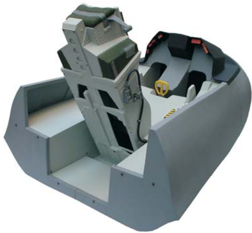
A view from the back